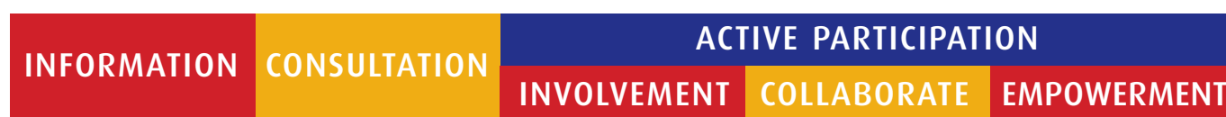
Figure 3. Active participation

Other similar terms used in the literature include ‘meaningful participation’ (Wills, 2012), ‘authentic participation’ (King & Feltey, 1998) and ‘genuine participation’ (Innes & Booher, 2004). Active participation is also closely associated with other emerging public governance concepts such as co-design (Briggs & Lenihan, 2011), co-production (Involve, 2005), public value (Stoker, 2006), and collaborative governance (Aulich, 2009).