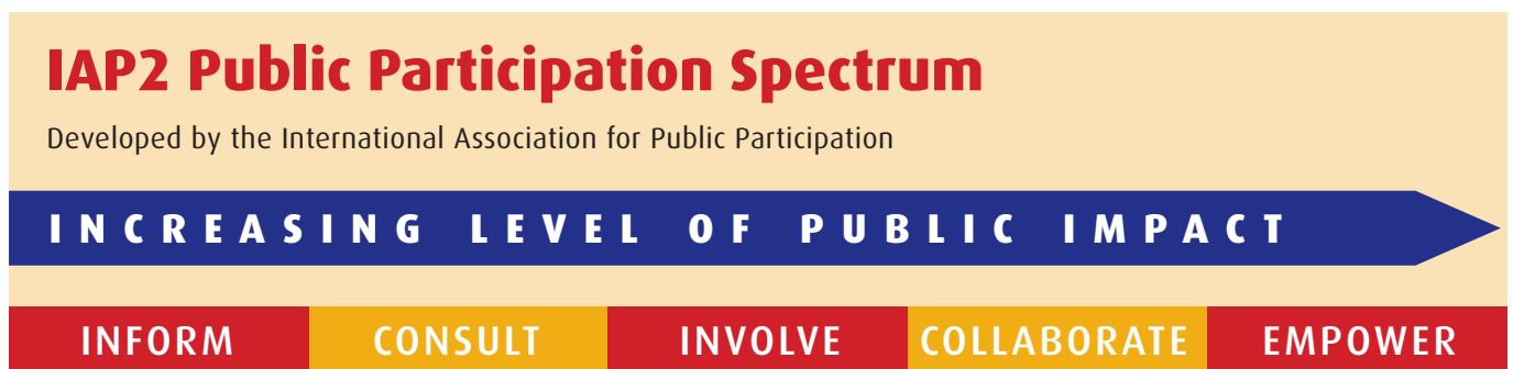
Figure 2. IAP2 Public Participation Spectrum

The spectrum model raises debate about what type of interaction between government and the public constitutes participation. Authors such as Barnes, (2007); Graaf & Michels, (2010); Meagher, (2006) argue there must be a level of influence or power in decision-making, which calls into question whether information or consultation can be defined as participation. Other writers claim citizen influence and power is not always practical or appropriate in every policy process or government decision (Evans & Reid, 2013; Fung, 2006; Gains & Stoker, 2009; OECD, 2009).