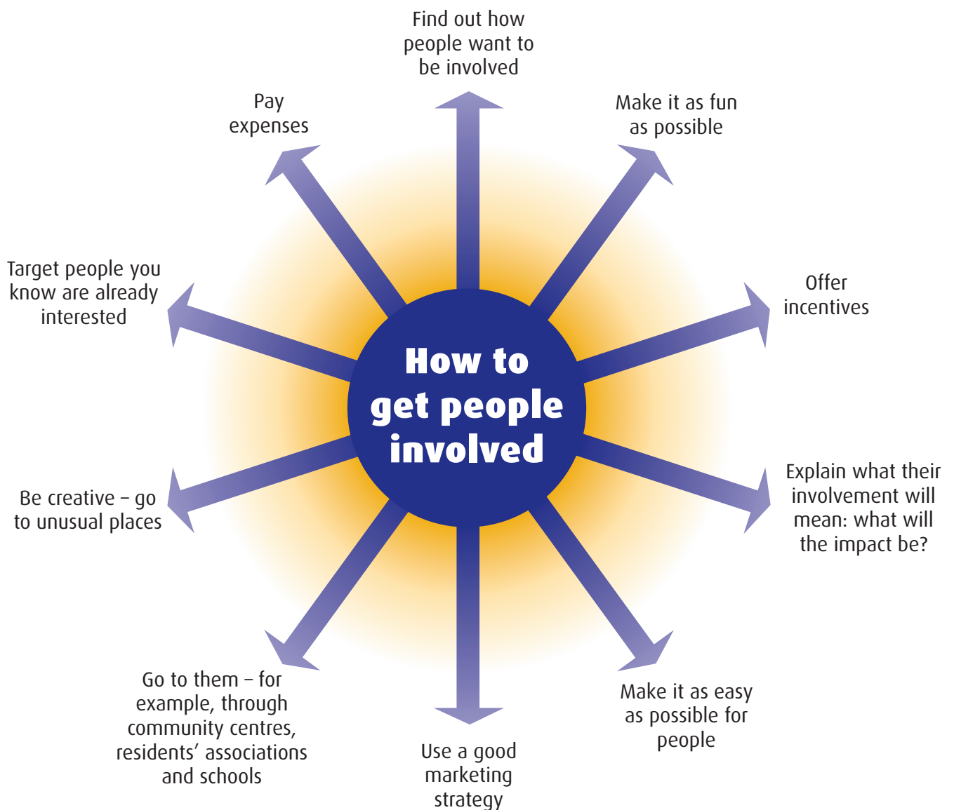
Figure 4. Tips for getting people involved

Source: Voluntary Action Westminster, Involving people: a practical guide , p. 59.