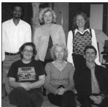
Policy and Communications Team